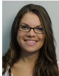
Kelly Ridge MSW-Mental Health