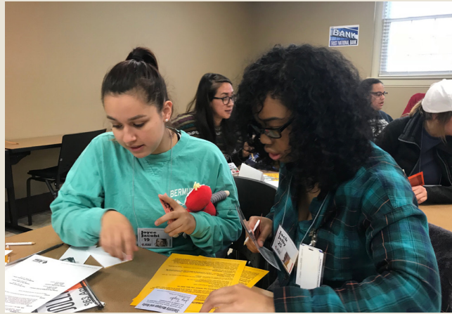
Poverty simulation participants prepare for their week.