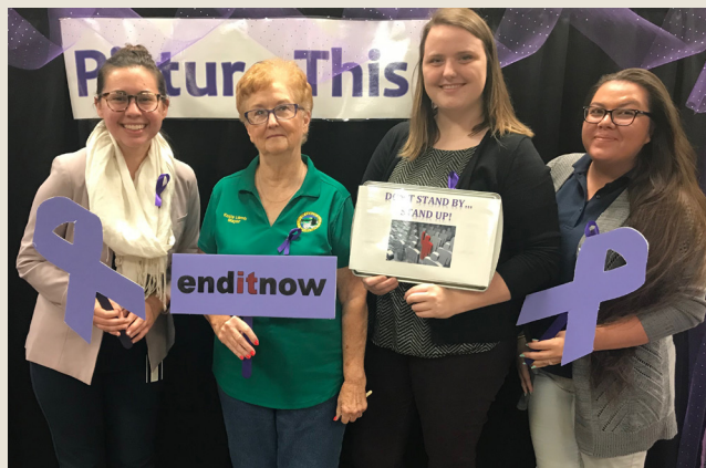
#PurpleThursday with Colgedale Mayor Katie Lamb