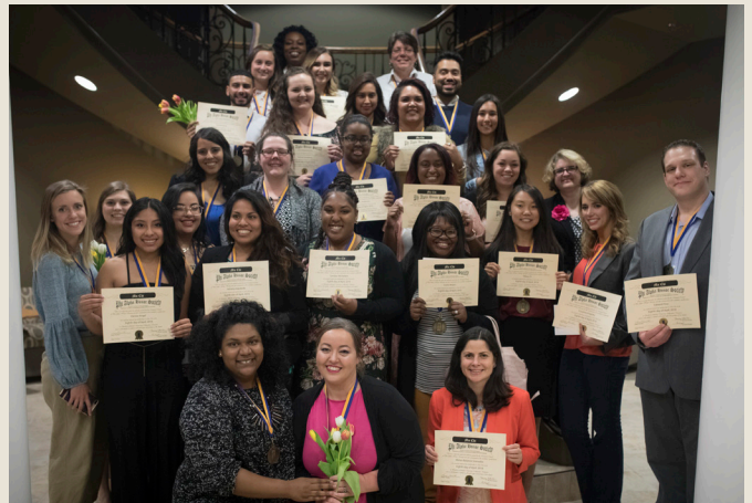
School of Social Work Phi Alpha Induction