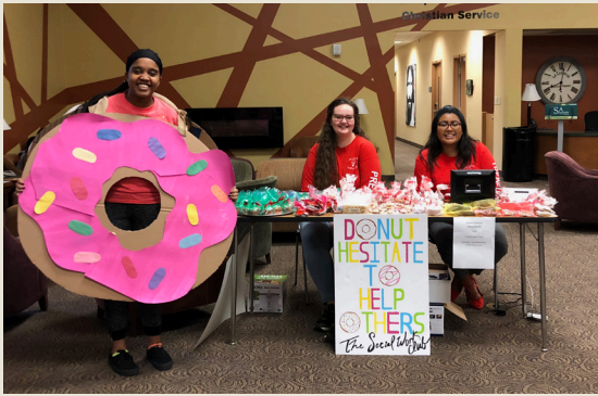
Social Work Club holds a bake sale.