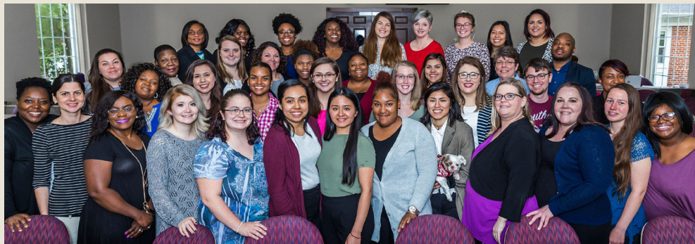
MSW 2018 graduating class