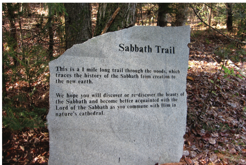
The Sabbath Trail

The downpour was so intense that the dense forest provided scant shelter. However, I was barely aware of the rain as I walked through the New Hampshire forest. I was too focused on the image of God revealed in both the nature that surrounded me and the history of the seventh-day Sabbath that was presented along the “Sabbath Trail” at the Washington Seventh-day Adventist Church. I agreed with a friend who said that everything that was needed to discover the truth was right there; one only needed to receive the message and then search the Scriptures.