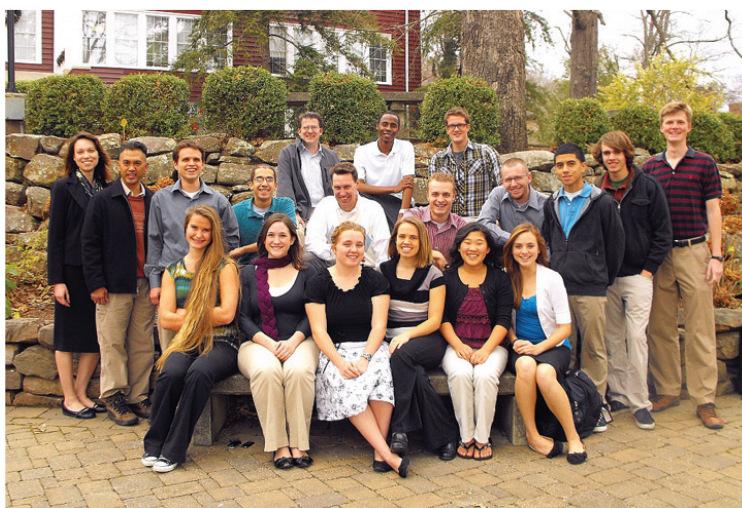
SALT Students and Staff

gram. Part-time and shorter summer options designed for busy individuals are also available. For more information, visit southern.edu/salt or call 423.236.2031.