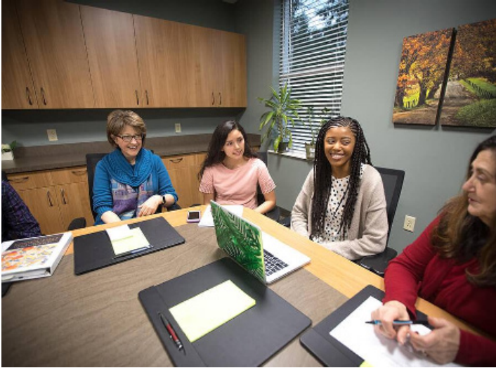
Students and professors in the counseling program appreciate the Giving Day donations that funded a recent student scholarship.