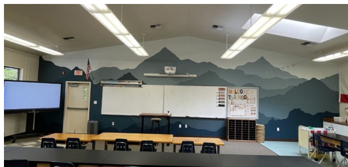
Kilroy painted this mural on her classroom wall.