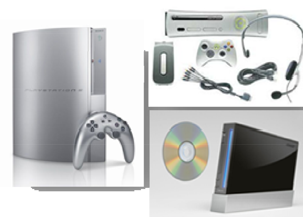
Video and Audio Games