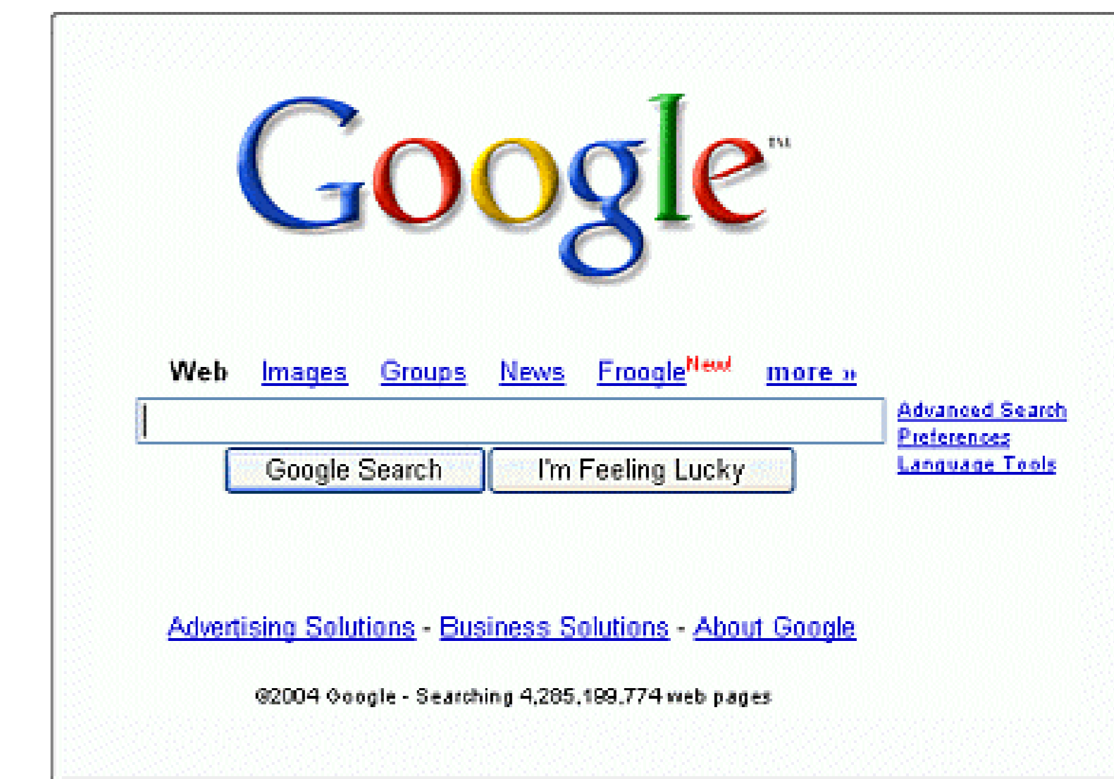
User Interface for Simple Search