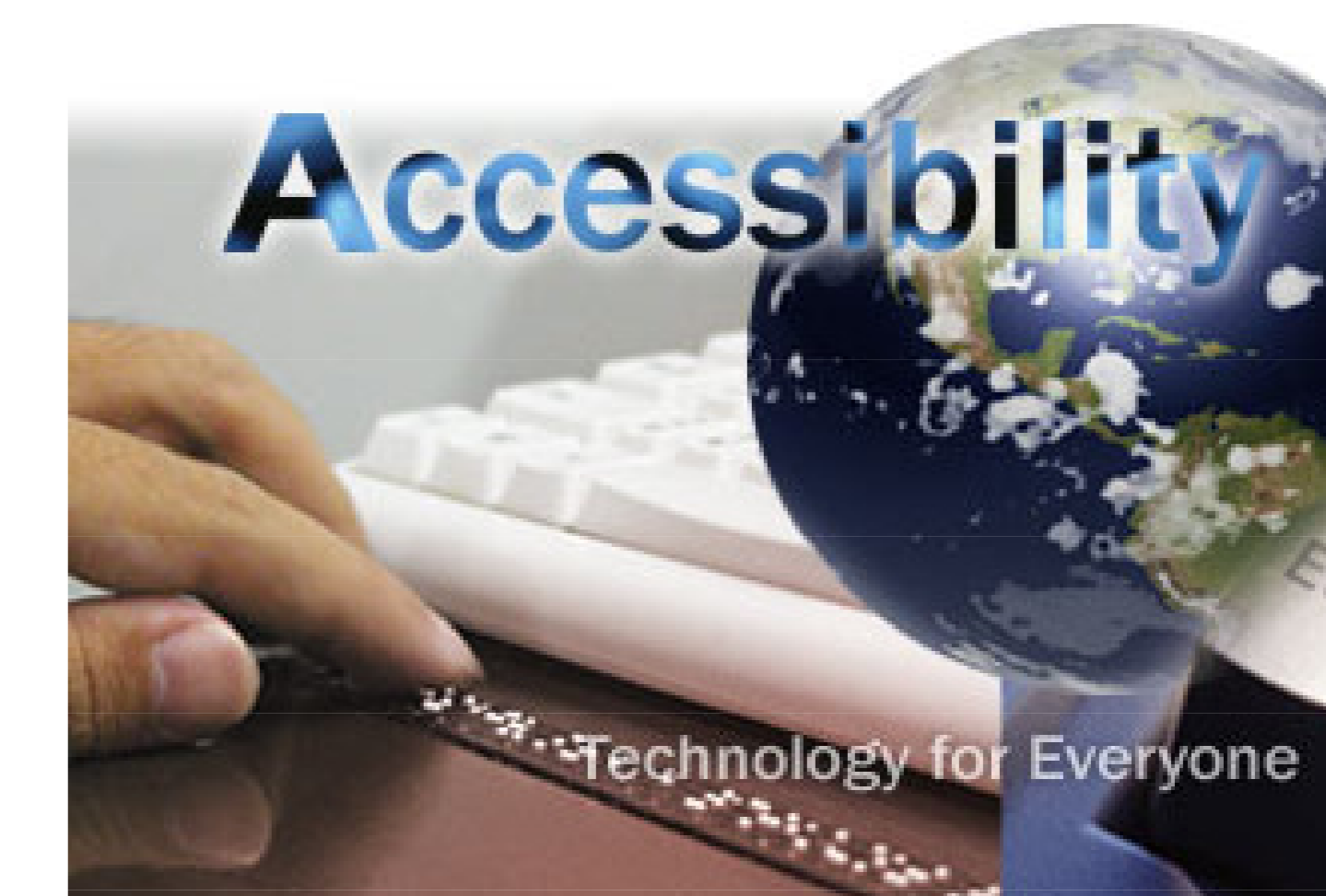
Web Accessibility for Everyone